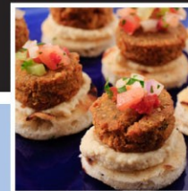
Grilled Pita Falafel and Vegetable Relish

Hospitality Services at Niagara University (716) 286-8399 ascott@niagara.edu