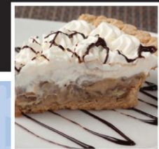
Praline Cream Pie